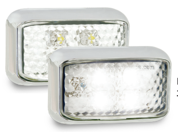
Part Number 35CWM - Blister Single