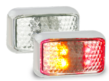
Part Number 35CCARM - Blister Single