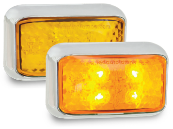
Part Number 35CAM - Blister Single