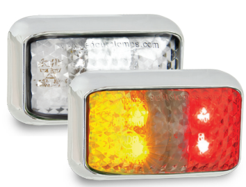
Part Number 35CARM - Blister Single