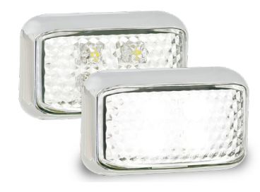
Part Number 35CCWM - Blister Single