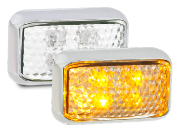
Part Number 35CCAM - Blister Single